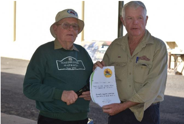
Austin Club Appreciation Certificate.