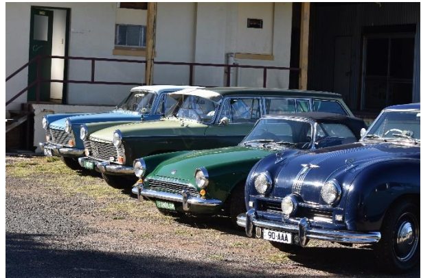
Austin Club cars at the Factory.