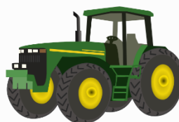
DRAW 2 - CHILDREN'S JOHN DEERE TRACTOR / FARM TOYSET