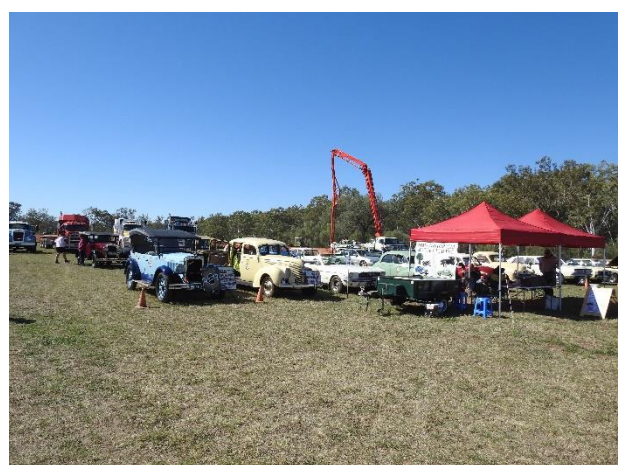
RHMC display at Plough-day & Tractor Pull.